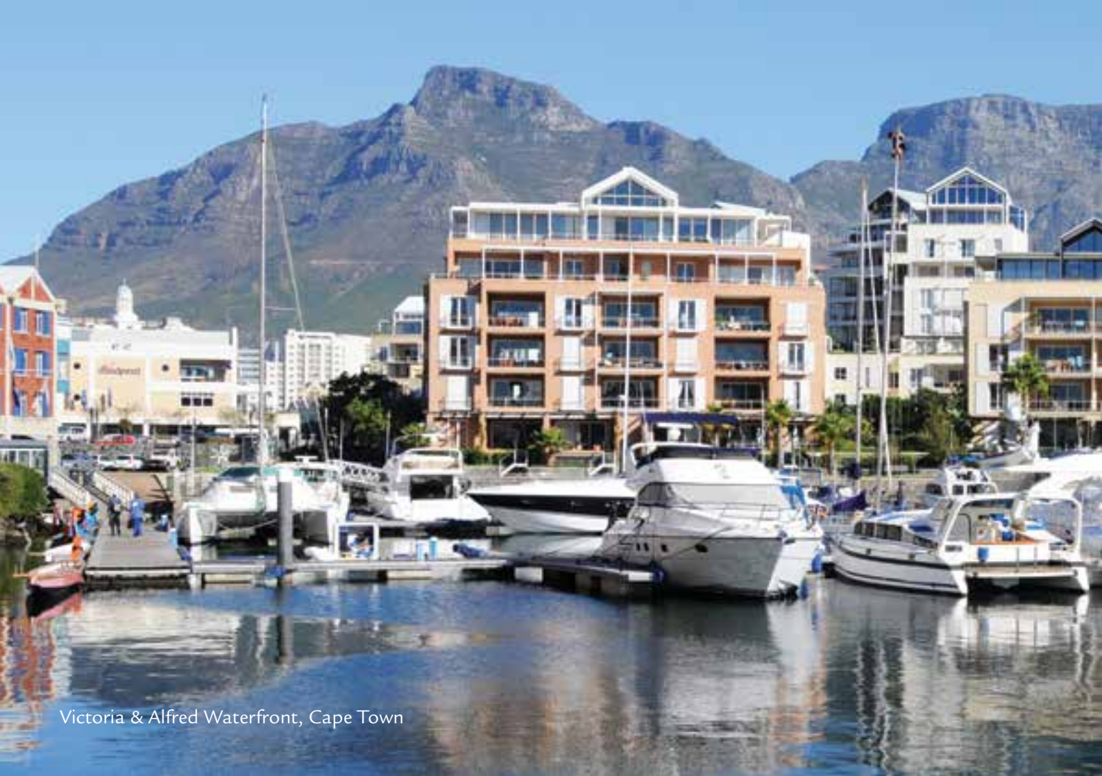
Victoria & Alfred Waterfront, Cape Town