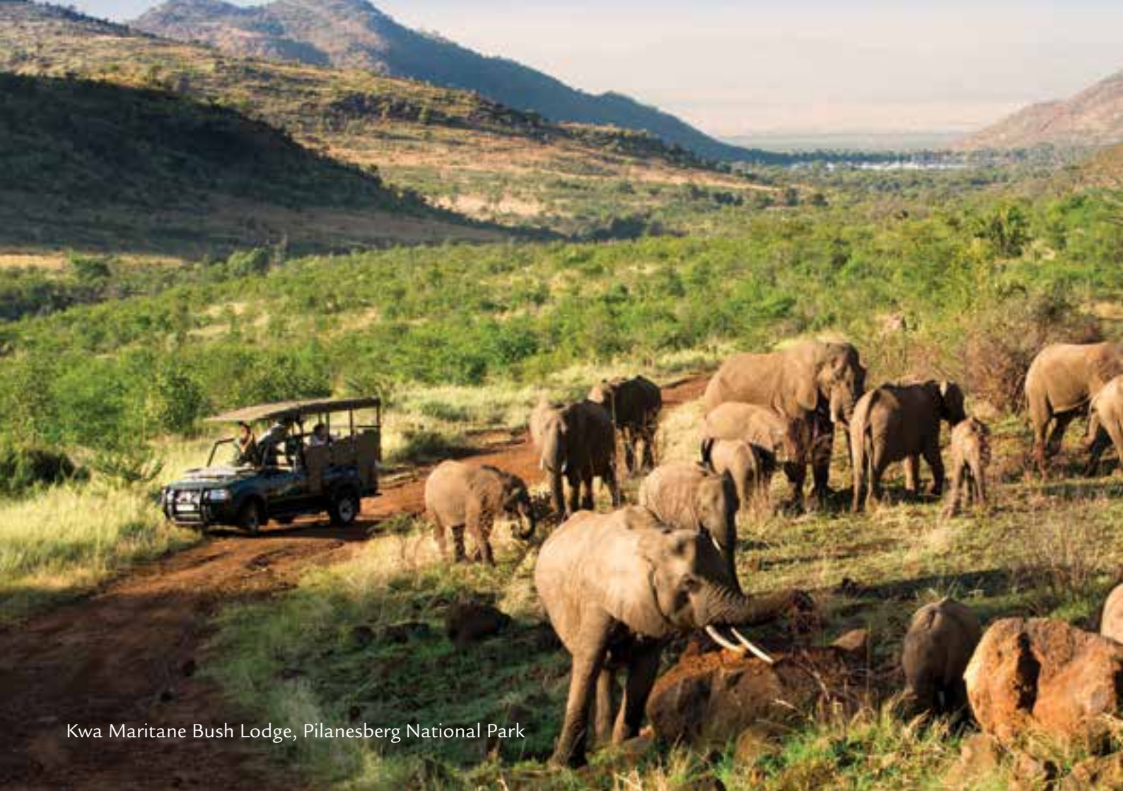
Kwa Maritane Bush Lodge, Pilanesberg National Park