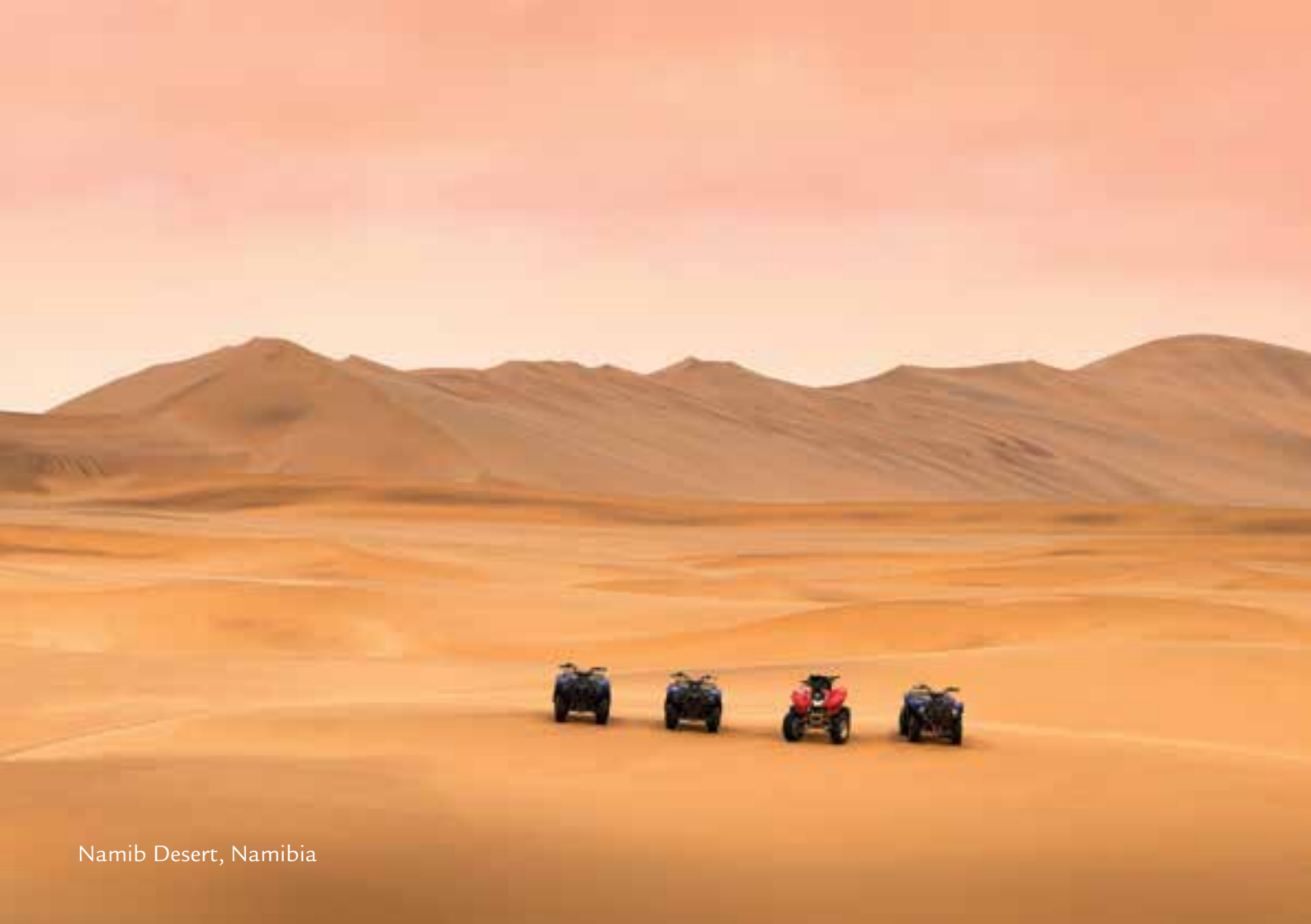
Namib Desert, Namibia