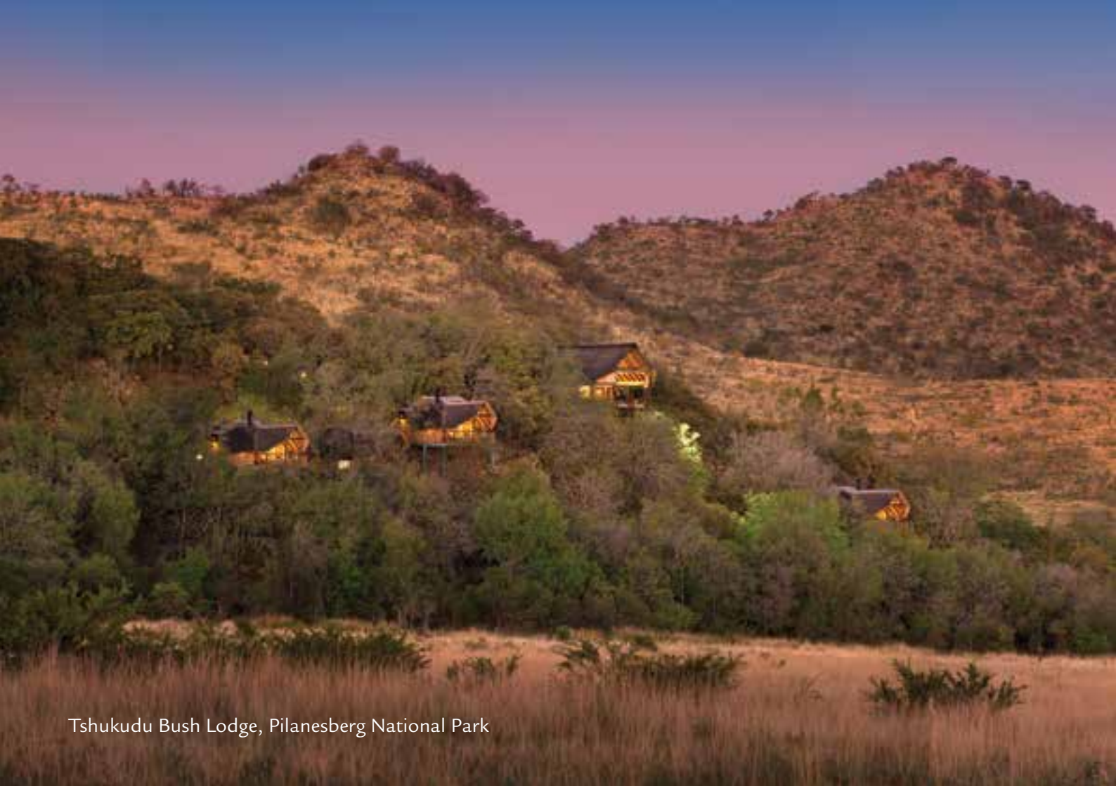
Tshukudu Bush Lodge, Pilanesberg National Park