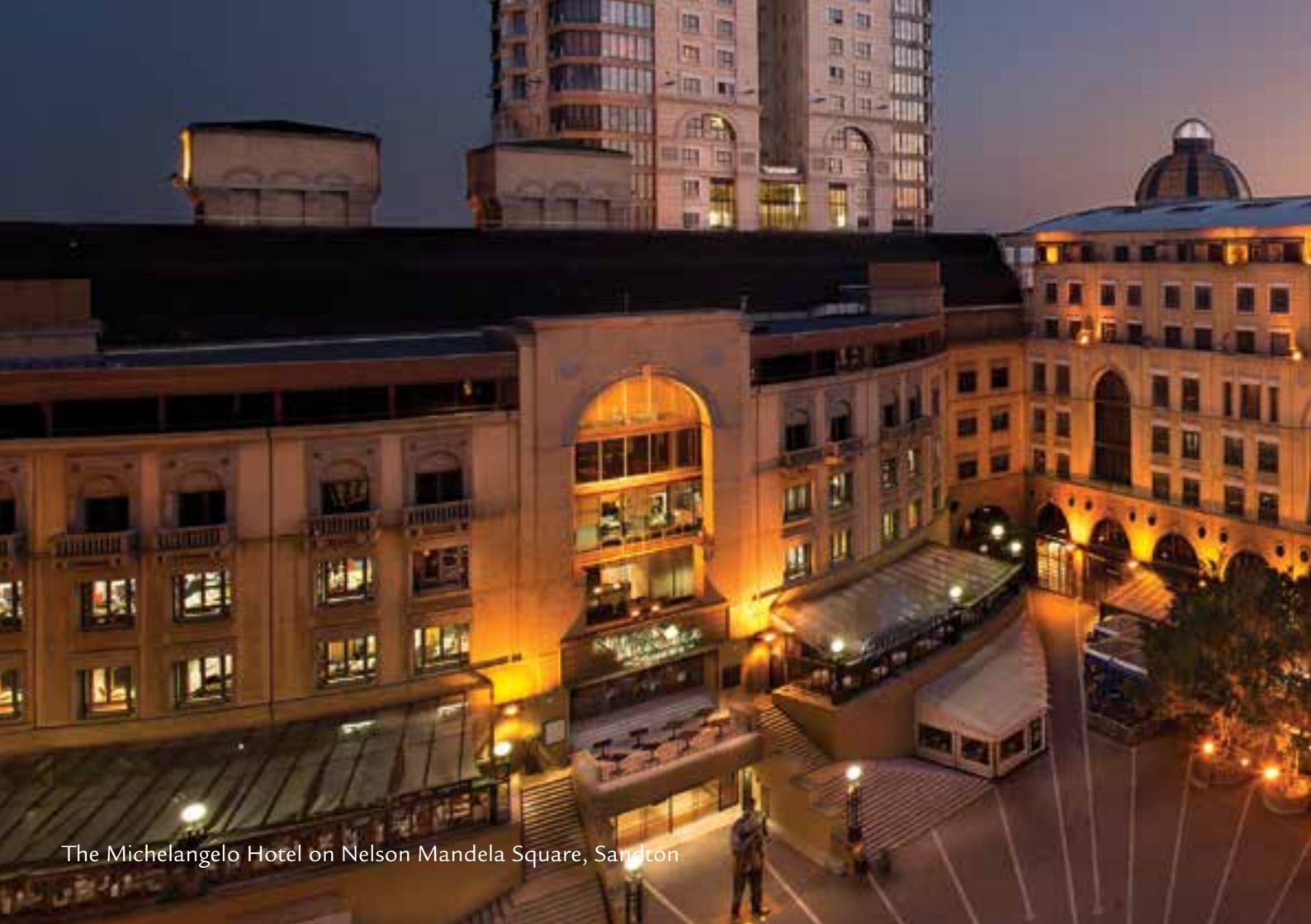
The Michelangelo Hotel on Nelson Mandela Square, Sandton